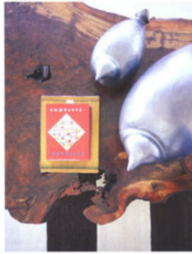
Left The living room features a Nakashima-style coffee table and ceramic birds, all found at a local gallery. Below The study features Room & Board's steel etagères and the Forge Dining Table with a walnut top that Westbrook transformed into an office desk. Seating from the showroom includes an Eames leather desk chair and a petite Eames molded plywood lounge chair, both by Herman Miller.