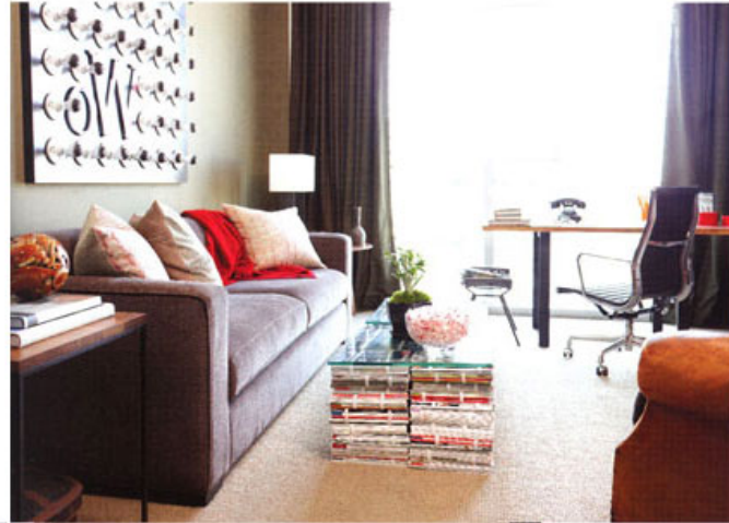
Below , from left Sullivan and Tyme End Tables and a pair of Duo Table Lamps flank the charcoal lan Sofa. A tangerine Boden Chair and Ottoman sits next to a Duo Floor Lamp. Percale linens and mohair pillows adorn the Architecture Bed, while a five-drawer Calvin Chest provides storage space. All of these items are available through Room & Board.