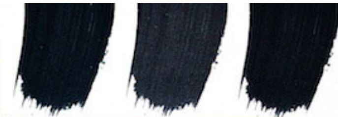
FROM FAR LEFT: Black Blue, $110 a gallon; farrow-ball.com. Ebony Slate, $53 a gallon; benjaminmoore.com. Caviar, from $32 a gallon; sherwin-williams.com.