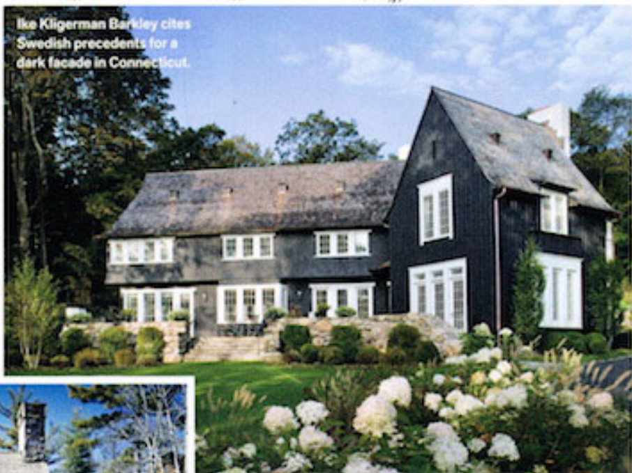
HOUSE: COURTESY FROM TOP LEFT: IBC PHOTOGRAPHY; DESIGN: IBC; DR: IBC; FOLLOWING