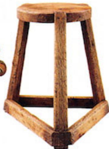
BELOW: Tripod stool, to the trade.