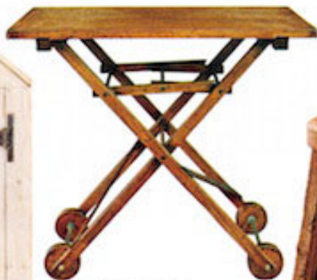
LEFT: Wooden Bird House cabinet, to the trade. ABOVE: Wooden Laundry Cart table, to the trade.